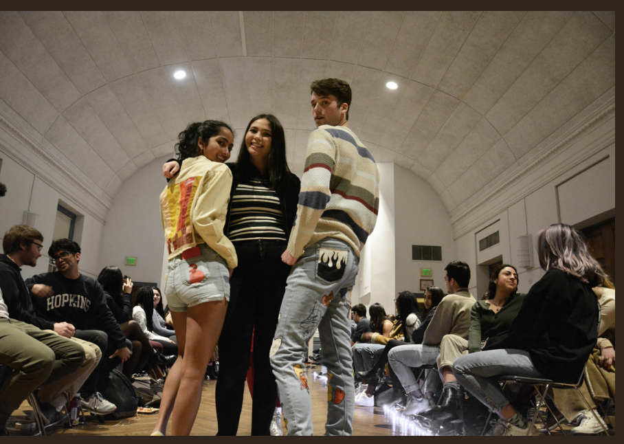
Designer and models at the annual Planet Runway Sustainable Fashion Show by Students for Environmental Action (SEA), Spring 2020.

The most sustainable purchase is one that isn't made at all, but your next best option is to buy secondhand!