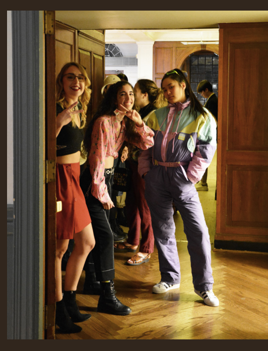
Backstage at the annual Planet Runway Sustainable Fashion Show by Students for Environmental Action (SEA), Spring 2020.