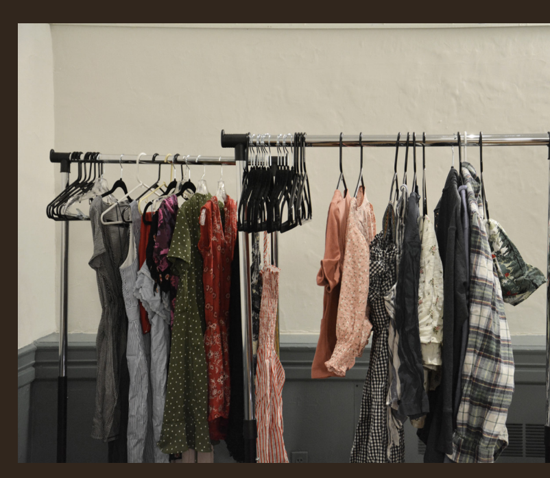
Clothing swap station at the annual Planet Runway Sustainable Fashion Show by Students for Environmental Action (SEA), Spring 2020.